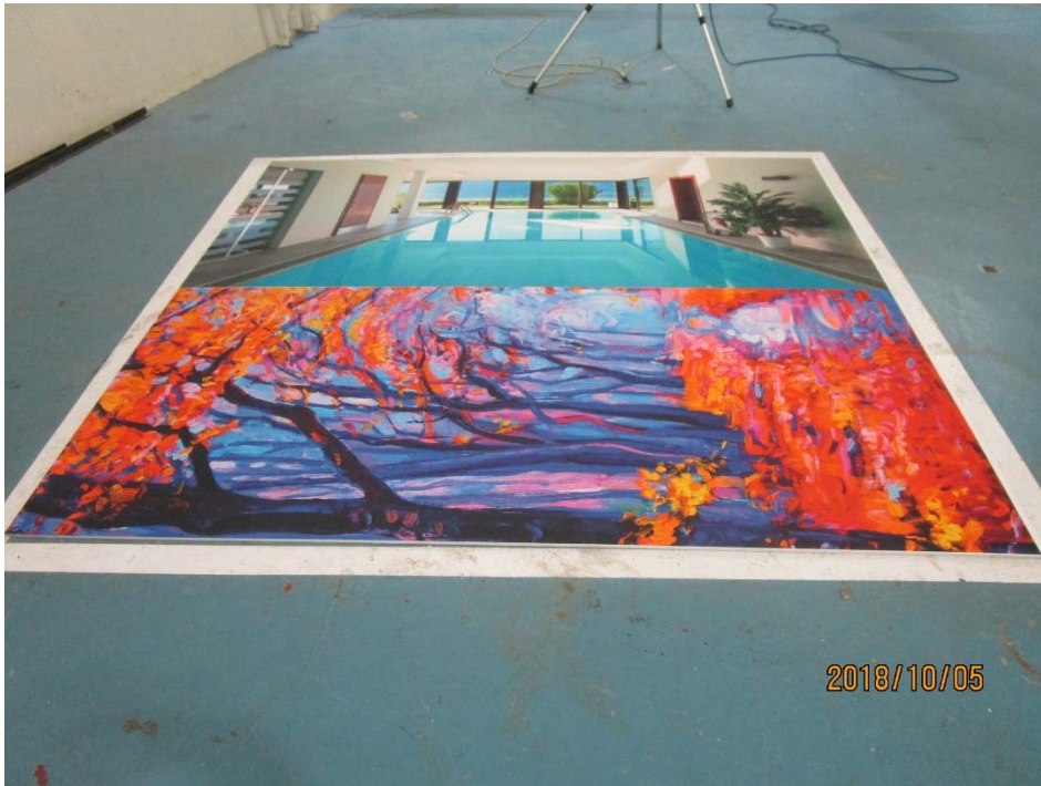
Figure 1 – Specimen mounted in test chamber