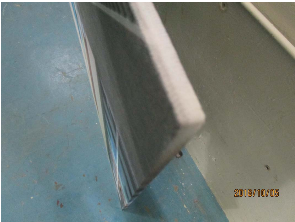
Figure 2 – Detail of specimen material